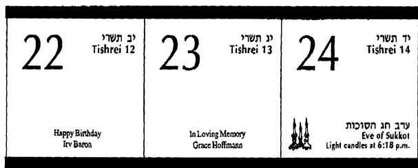
Sample calendar date space

Include business card, camera-ready ad or print the text of your message below. If necessary, type ad on a separate paper. For Anniversary, Birthdays, or Yahrtzeit, please include name of person & Hebrew or civil date of occasion.